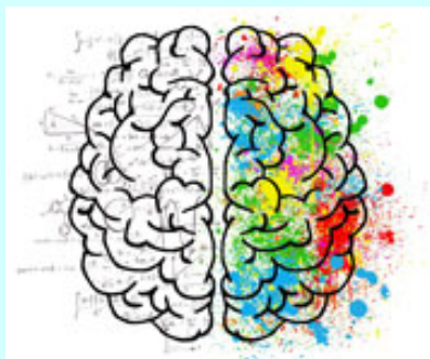
Executive Function and Executive Function Disorder

Educators and people in general always ask why our daughter is so exceptional in some categories and so challenged in others. Well first- that is ALL of us right? I honestly cannot answer even though I have researched cognitive theory and neurotypical behavior for over a decade now. The short answer is the brain is beautifully complex. I was told by an exceptional Occupational Therapist, (OT) many years ago to stretch our daughter's brain by exposing her to varying experiences.