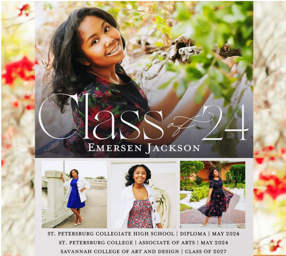
ST. PETERSBURG COLLEGIATE HIGH SCHOOL | DIPLOMA | MAY 2024